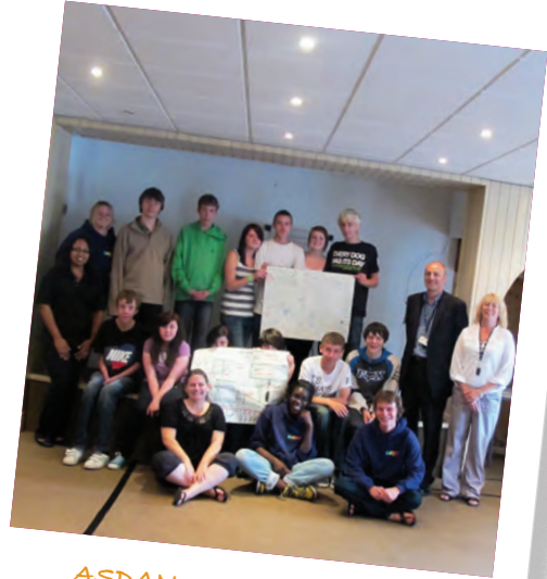
ASDAN youth awards team

The last day was spent working on their ASDAN Youth Awards. Soha are a registered centre for ASDAN Awards and will be accrediting them for the young people. The awards will help towards recognising the hard work, effort and commitment that the young people have put into the summer programme. The final day before their graduation was spent in a rainy Henley on Thames market place, selling locally sourced flowers to raise money for their two charities of their choice.