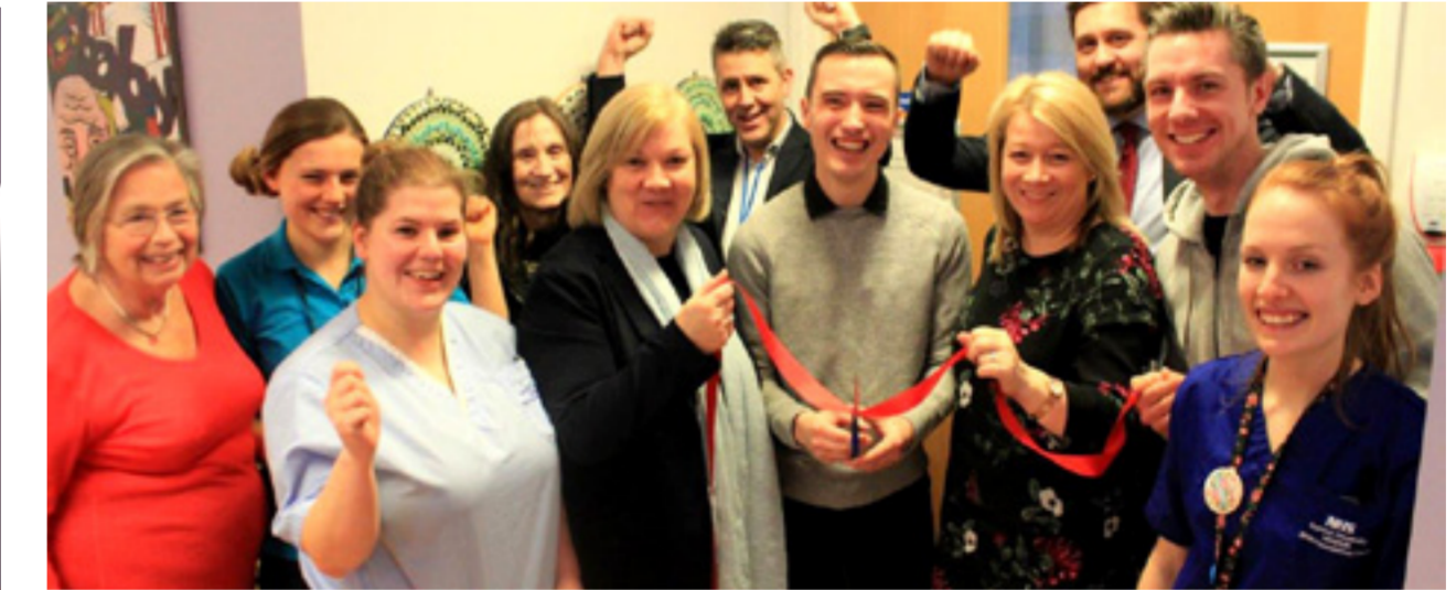
The Play2Give room at Oxford Children's Hospital